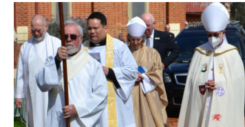
ABOVE:: The funeral service. LEFT: The officiating clergy lead the funeral cortege after the service.