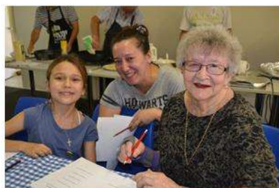
Pancake Day, 2020

To reserve your place at the table, email Tom Winterbourn at twinterbourn@ozemail.com.au