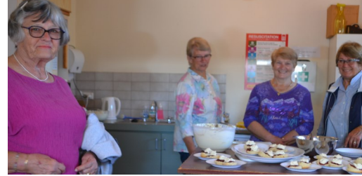
LEFT: The Devonshire tea ladies. RIGHT: The king was in his counting house counting all his money!